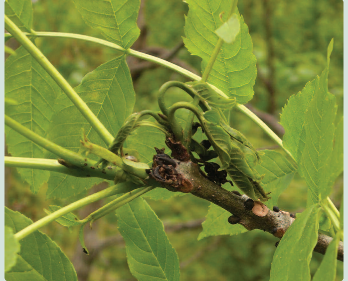
An ash tree infected with Chalara fraxinea , sometimes known as Hymenoscyphus pseudoalbidus (which describes another life stage).

Ash dieback is a disease of ash trees caused by the fungus Chalara fraxinea . The disease causes leaf loss and crown dieback in affected trees and often leads to tree death. Ash trees showing symptoms of Chalara fraxinea are now widespread across Europe and in 2012 it was detected for the first time in Britain – initially in a consignment of infected trees sent from the Netherlands to a nursery in the south of England, but later in trees planted in the natural environment. Surveys have now confirmed the presence of ash dieback disease at more than 150 locations in England and Scotland, including established woodlands. Chalara fraxinea is being treated as a quarantine pest under national emergency measures; it is important that suspected cases of the disease are reported.