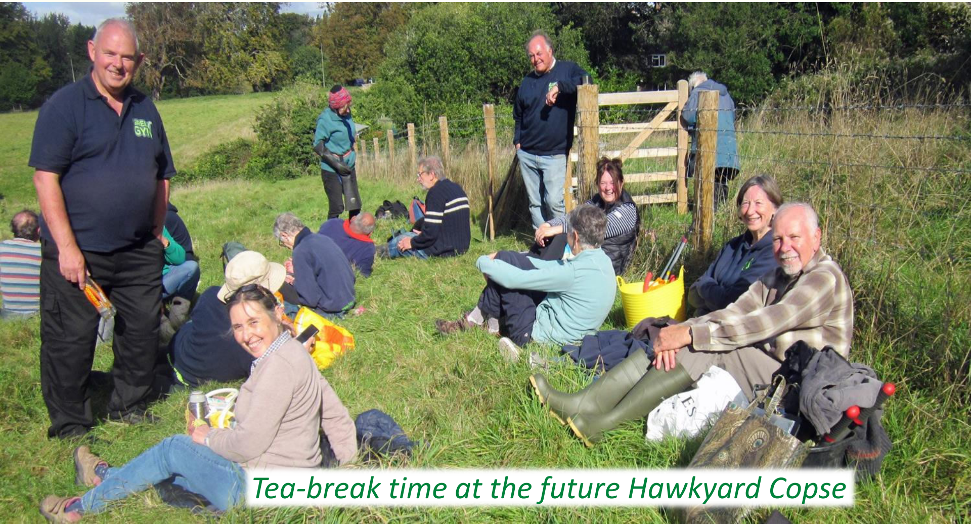
Tea-break time at the future Hawkyard Copse

Interested in joining the team and giving it a try? Then email us via www.chippygreengym.org You'll get a warm welcome – rain or shine!