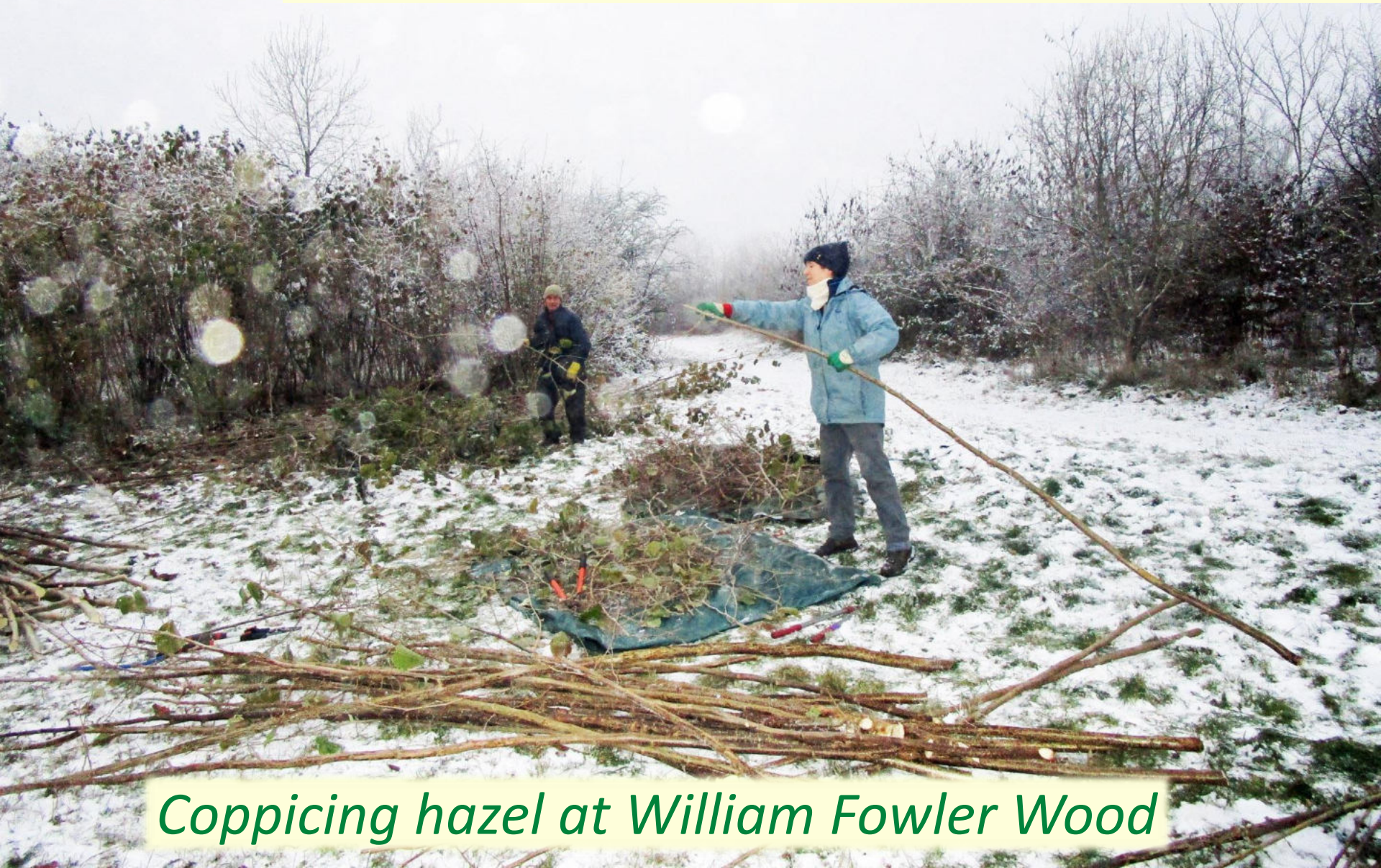
Coppicing hazel at William Fowler Wood

GREEN GYM ® promotes physical and mental well-being and is recommended by GPs everywhere.